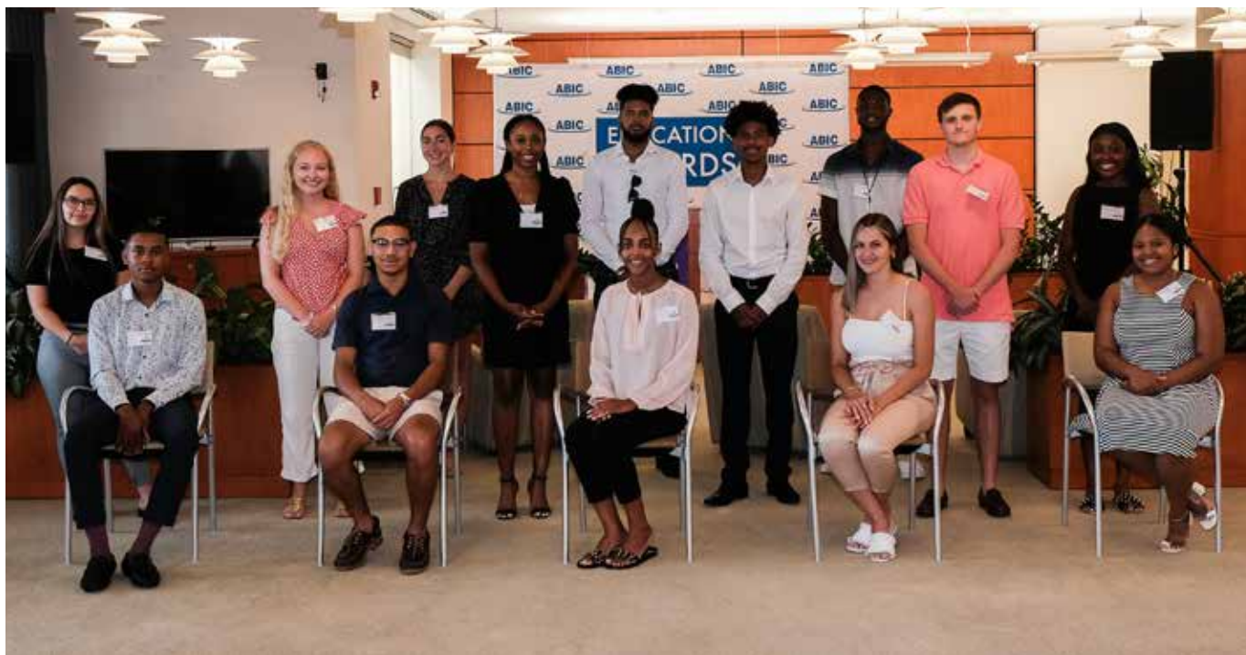
Top: 2021 Awardees

Our Mentor Program matches experienced professionals with awards recipients to provide personal one-on-one support, knowledge sharing, perspective and wisdom to help them through their academic journeys and with career planning. The mentors are from our sponsor companies, alumni and others in international business who are willing to help and make a lasting impact on the lives of the students.